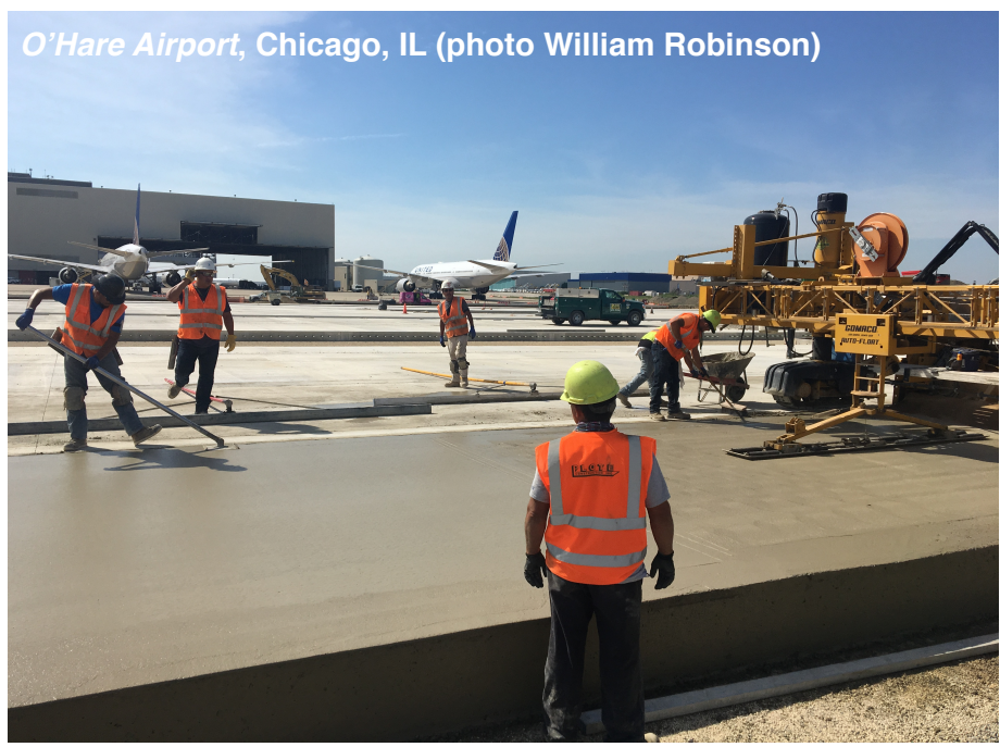
O'Hare Airport, Chicago, IL